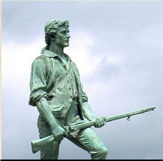
Captain John Parker

Facing an impending rebellion, British General Thomas Gage decided to seize weapons and gun powder being stored in Concord, Massachusetts, twenty miles northwest of Boston, to prevent violence. Patriot spies soon got wind of Gage's plan. Paul Revere and other riders spread the word of the 800 British regulars who were dispatched to Concord.