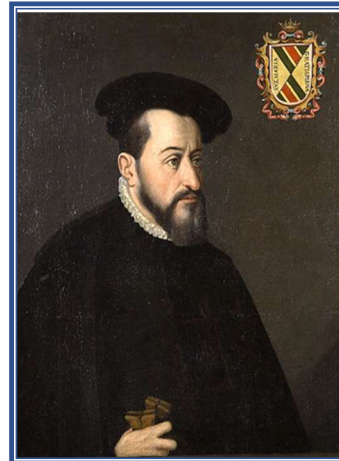
Viceroy Antonio Mendoza, 1535

In the Spanish colonial structure, the role of the viceroy was vital as they were responsible for governing the wide spread territories of Spanish America. Viceroys were the highest-ranking officials in the colonies and their authority was second only to the King himself. The first viceroy of the Spanish colonies was Antonio Mendoza, who was appointed in 1535. Mission San Antonio de Valero, known today as the Alamo, was the first mission and was established by Franciscan missionaries in 1718 to introduce the Indians to Christianity.