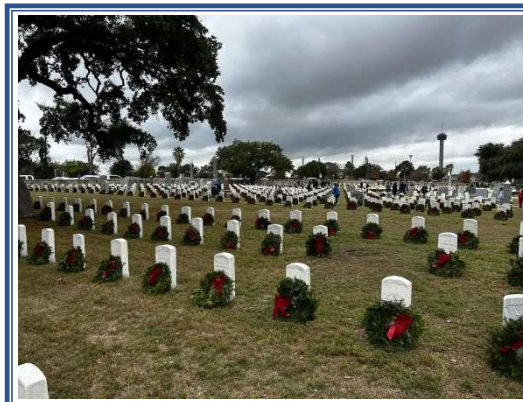
Veterans Graves With Wreaths