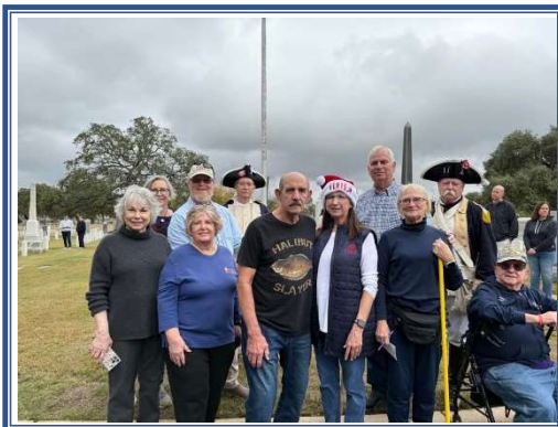
SAR - DAR Members