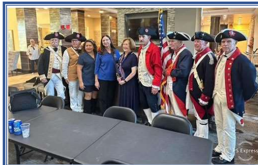
Chapter Members, Veterans, and Veteran Spouses