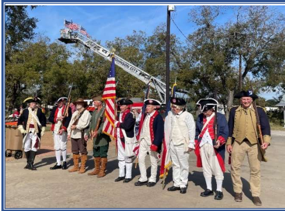
Memorial Color Guard