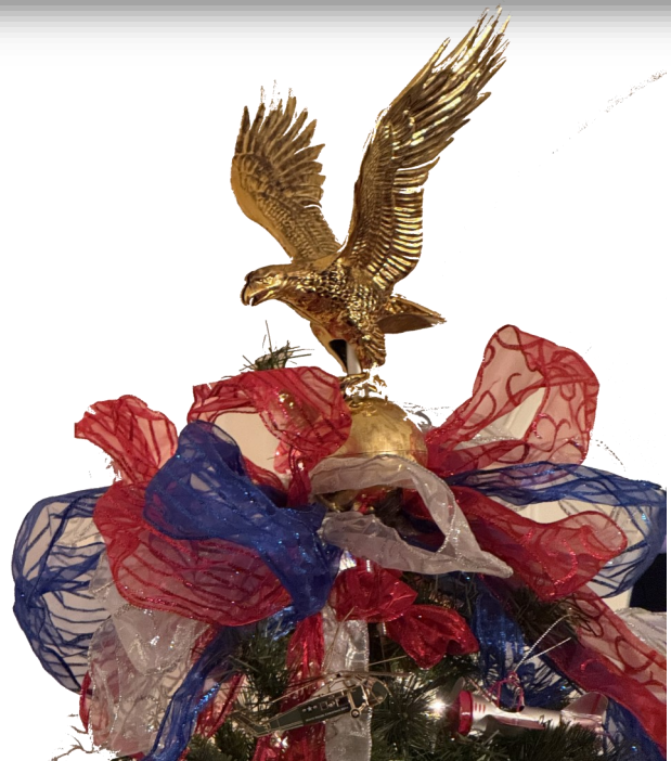
White House and Texas Capital Ornament Tree TOP