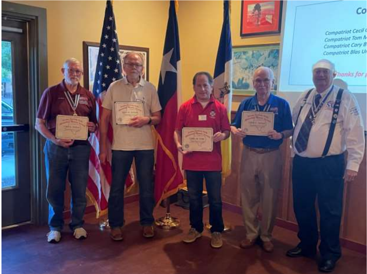
Texas Society SAR Historian Honor Award recipients