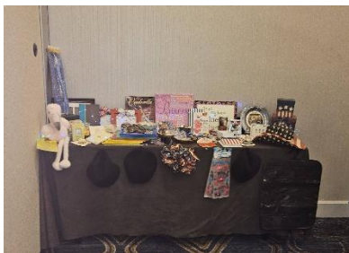
Door prize table!

Then, we made patriotic cards to thank the Compatriots for the patriotism. Those were handed out at the banquet.