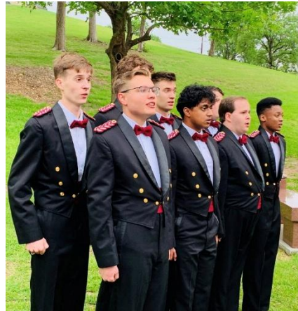
Texas A&M Singing Cadets

Ladies attended the Monument dedication at the Texas State cemetery where they handed out the programs, Saturday morning.