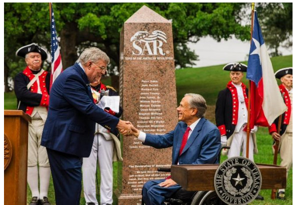
Governor Abbott was inducted into SAR!