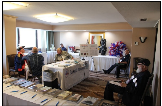
Volunteers staff the Registration Desk and the Silent Auction room.