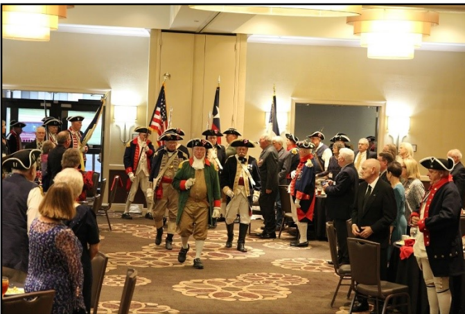
The Color Guard posts the colors during Saturday evening's Banquet.