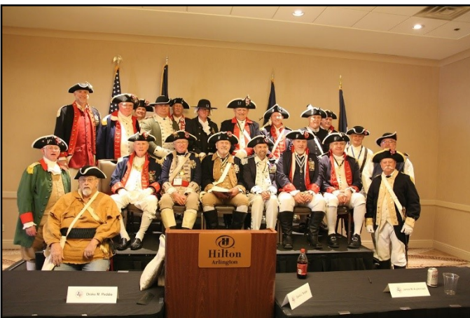
The Texas State Color Guard