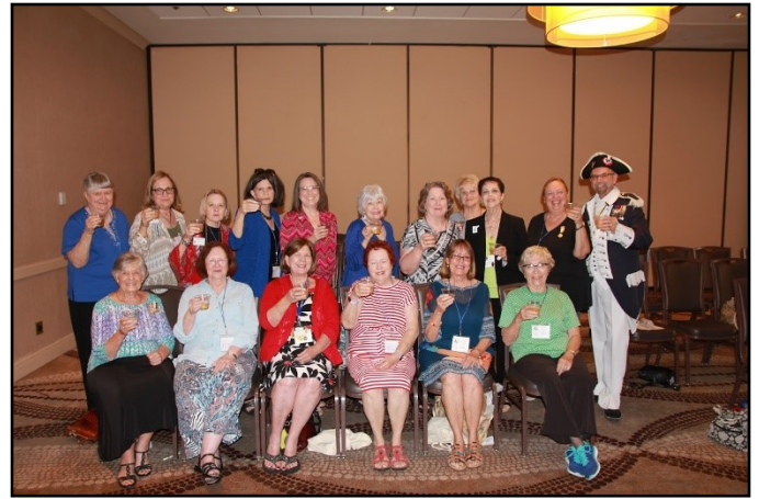
During the Ladies Auxiliary meeting, they toasted the 1,000,000th new member admitted to the National Society of the Daughters of the American Revolution.