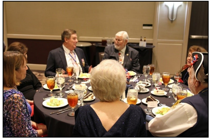
Saturday evenings Banquet