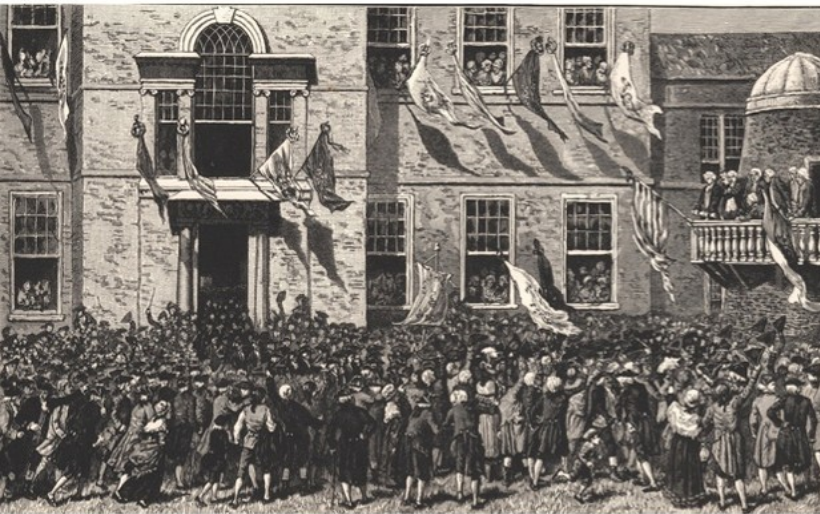
America rejects the mother country: a 19th-century engraving depicts the moment the Declaration of Independence was read out at Philadelphia in 1776.