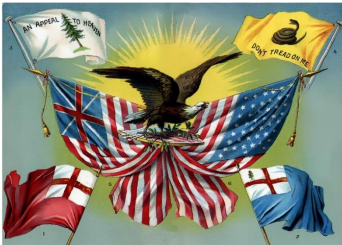
Photo from an 1885 US History book

On the evening of Saturday, September 1, 1945, Americans gathered around their radios, waiting for a historic broadcast from the USS Missouri, anchored in Tokyo Bay. It was already September 2 in Japan, and after 2,194 days of conflict and an estimated 60 million military and civilian deaths worldwide, peace had finally come.