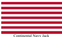
Continental Navy Jack

The Continental Navy was the navy of the United Colonies and United States from 1775 to 1785. It was