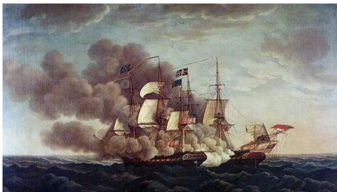
Navy USS Constitution vs Guerriere