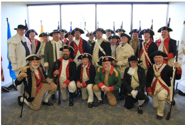
130 th Texas State Convention Color Guard

wearing Period Attire (Continental Uniform/Militia Uniform or Period Attire worn by civilians). Note: this cannot be counted on Tab 8. Points are earned per presentation and NOT per compatriot(s) participating in the presentation. For purposes of the Education Committee, please enter the number of attendees at each presentation as well as the name of the compatriot presenter(s).