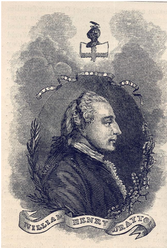
William Henry Drayton, Head of the Secret Committee

April 19, 1775 – the battles of Concord & Lexington are in every history book. But there is more to the story –