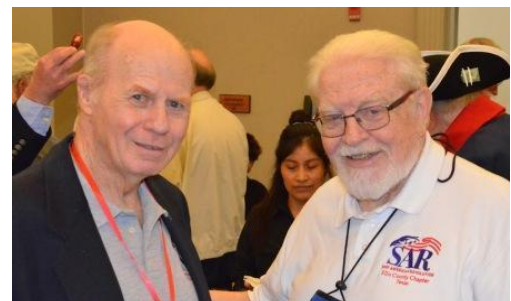
Taylor & Haughton Convention participants