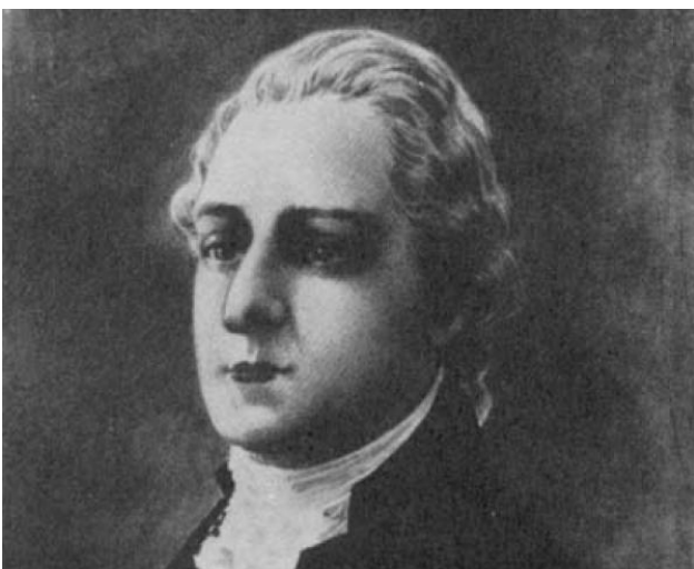
Dr. Benjamin Couch, Doctor/Spy

Benjamin Church, a Rhode Island-born, Harvard-trained physician, was considered by friends and neighbors a fierce Patriot and unwavering advocate for independence. He was a known member of the famed Sons of Liberty – a secretive band of colonists who organized opposition to British policies – and a close associate of revolutionary figures John and Samuel Adams, John Hancock, and Paul Revere