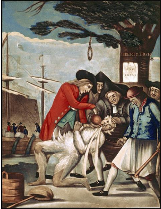
Tarring & Feathering, 1774