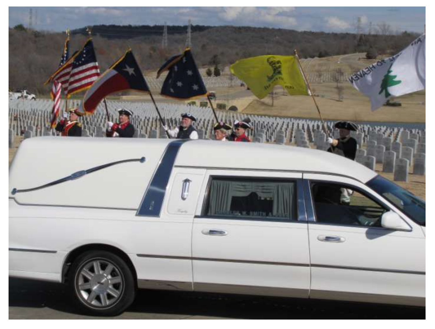
TXSSAR CHAPTERS REPRESENTED DALLAS, DENTON, EAST FORK/TRINITY, PLANO, & MAJOR VAN ZANDT