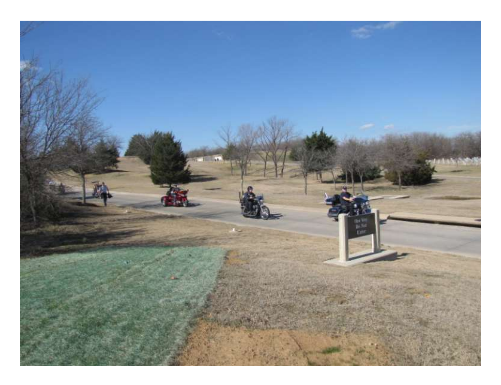
The Patriot Guard Riders