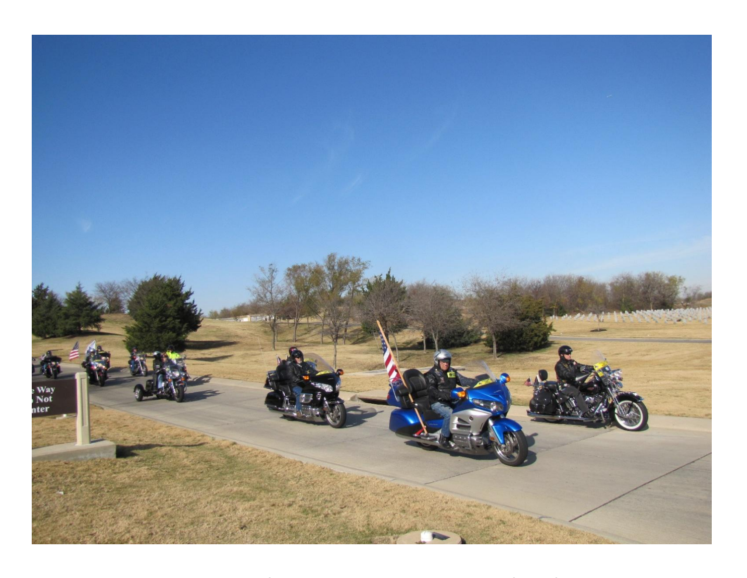
North Texas Patriot Guard Riders