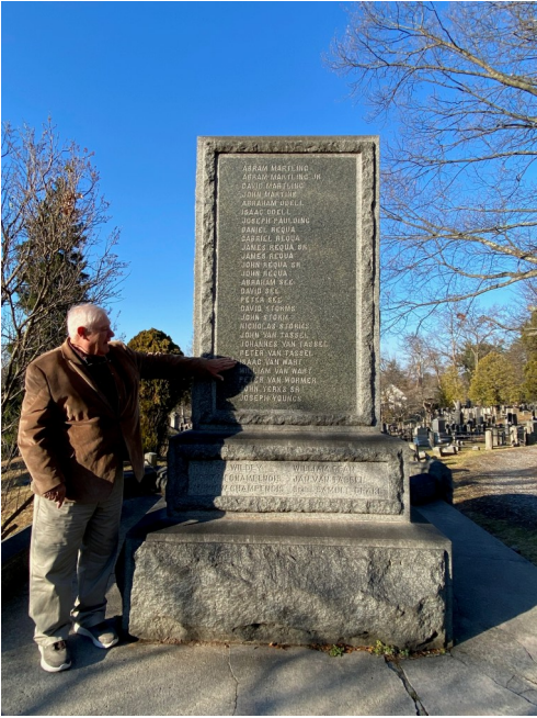
Tarrytown Revolutionary War Heros Monument Located in Sleepy Hollow Cemetery