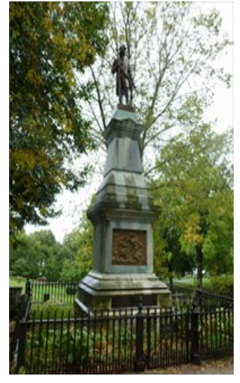
Captors Monument in Tarrytown New York