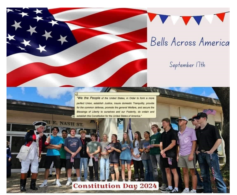
Poetry Community Christian School's US Government class attended the Terrell Constitution Day program and recited the Preamble with George Washington!