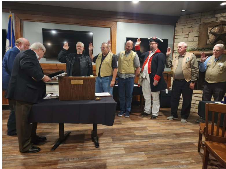
2023 Officers Sworn In