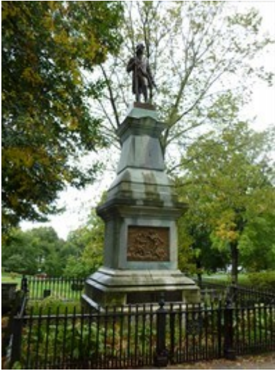
Captors Monument Tarrytown. New York