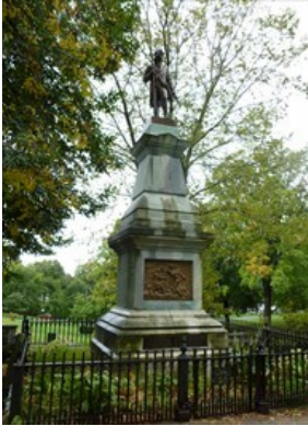
Captors' Monument Tarrytown, New York