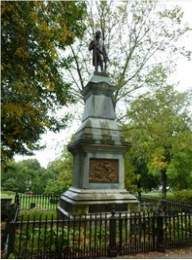
Captors Monument Tarrytown, NY