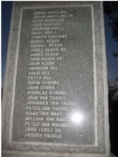
Revolutionary War Heroes Monument Tarrytown New York

If you haven't already paid, this is a reminder that dues are now due. I know mail has been hit and miss this year, so some of us didn't receive a reminder. The website to go to if you want to pay online is https://texassar.org/dues.htm It gets a little tricky if you have pop-up blockers turned on. You need to know how to turn them off, and the website has instructions for some operating systems.