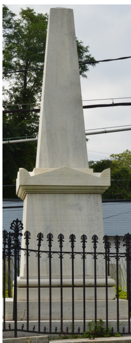
Isaac Van Wart's Grave at Elmsford, NY