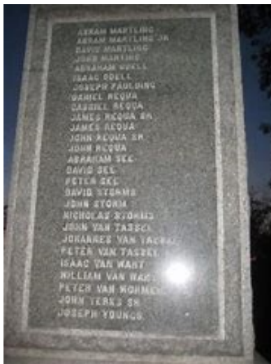
Revolutionary Soldiers Monument at Tarrytown, NY