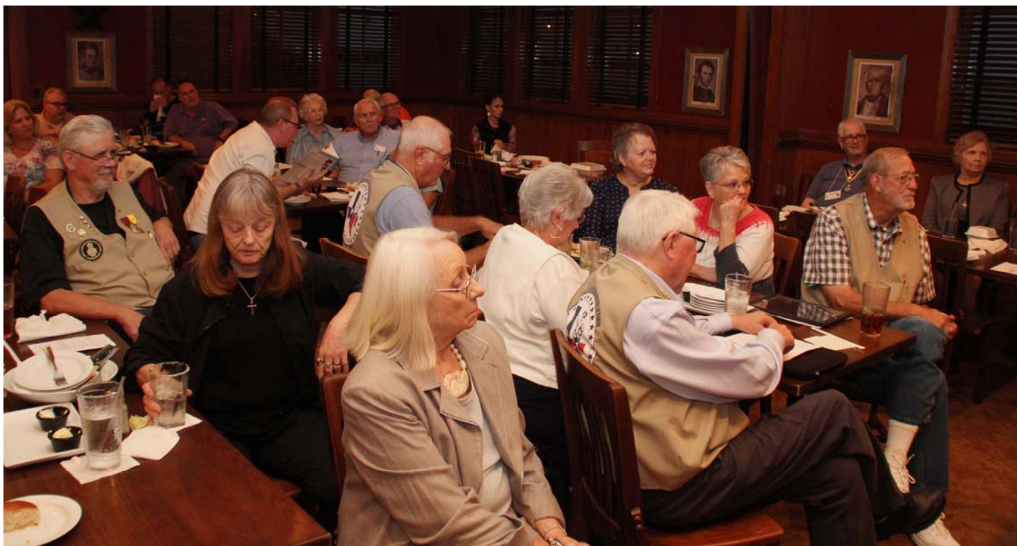
October Chapter meeting.