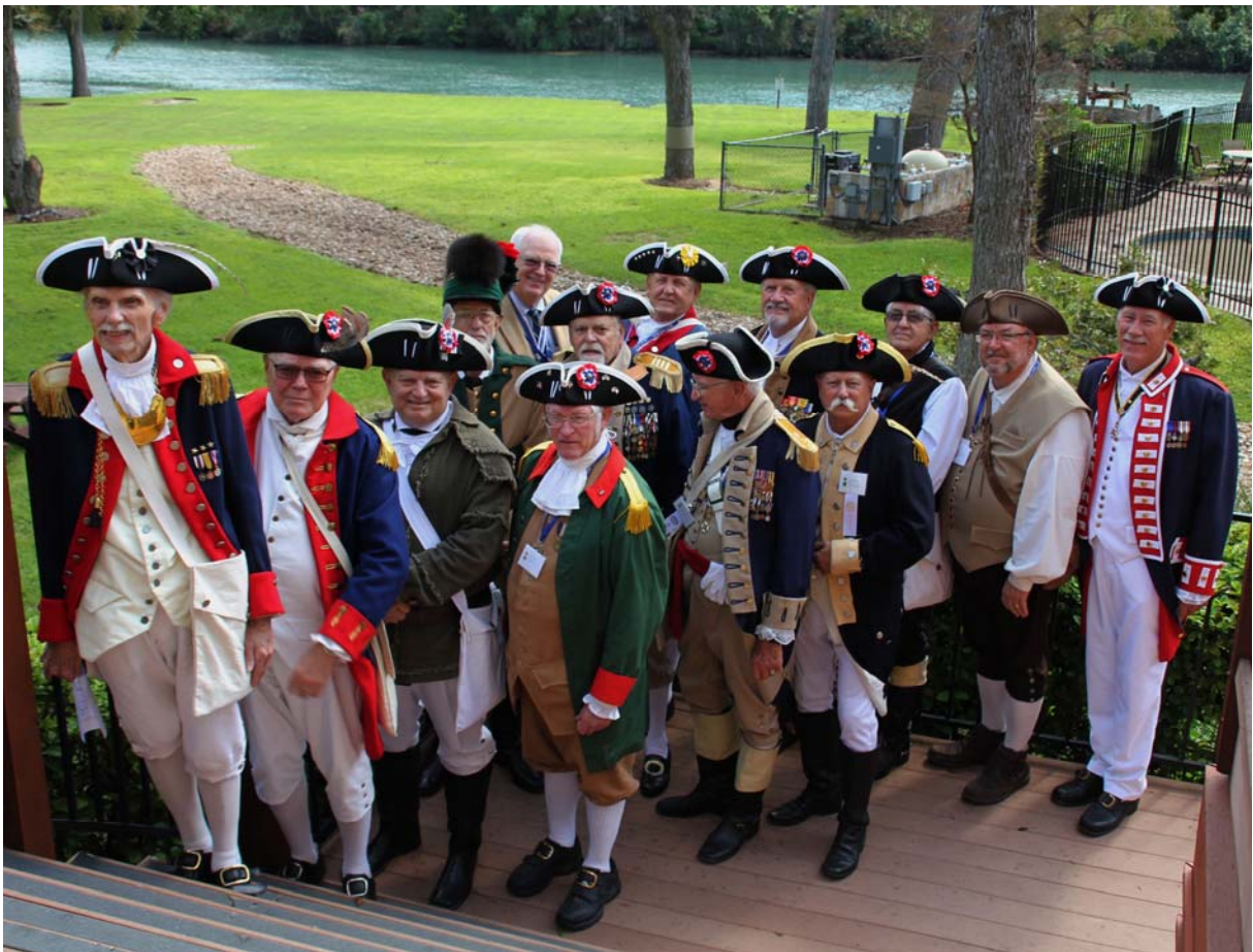
Board of Managers meeting in New Braunfels.