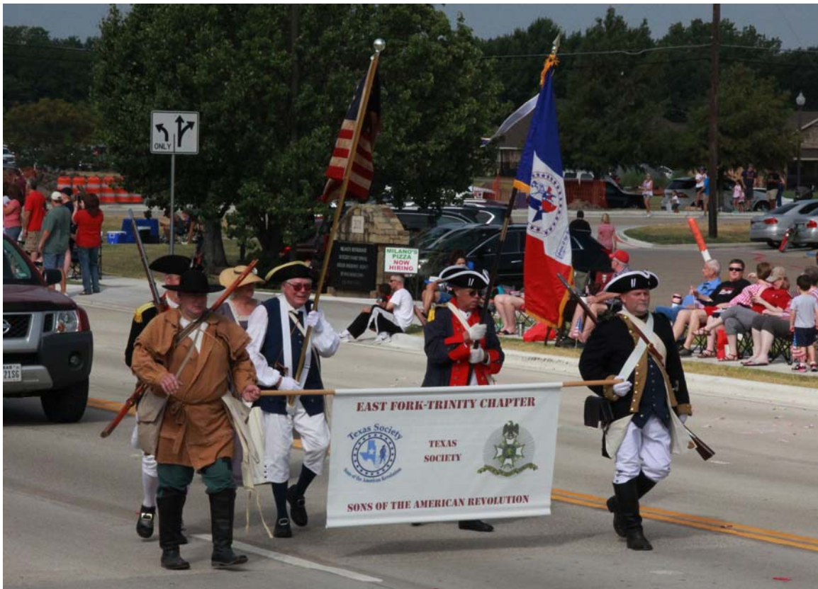
Independence Day Parade in Heath.