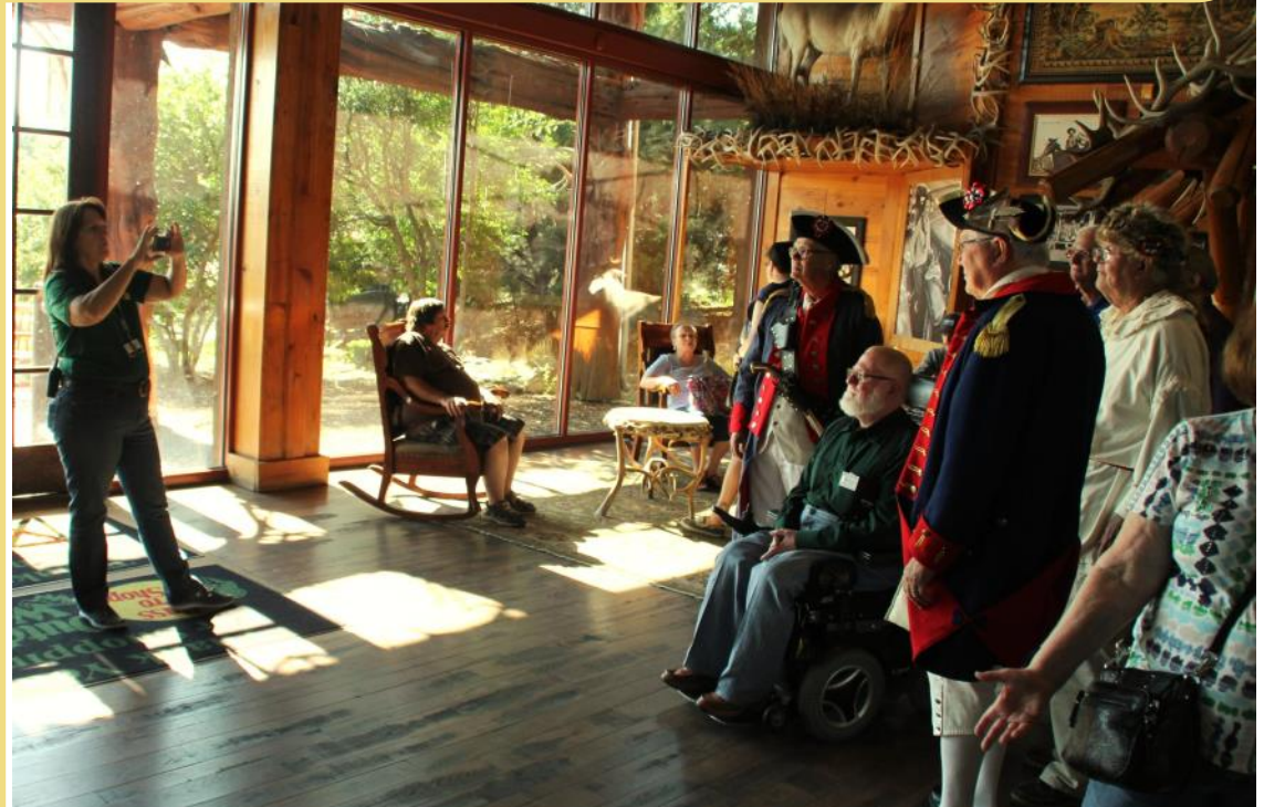
Flag certificate presentation at Bass Pro Shop preceding our June chapter meeting.