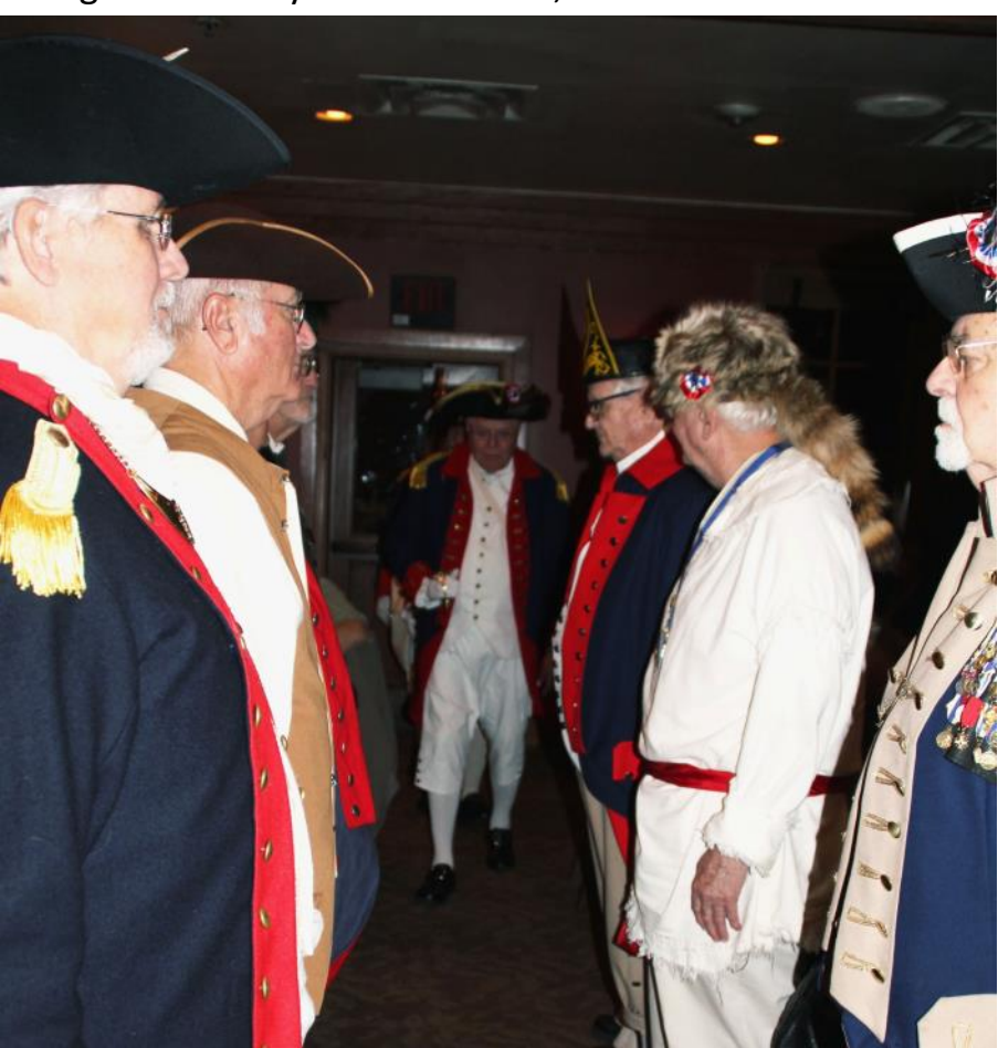
Color Guard Change of Command Ceremony.