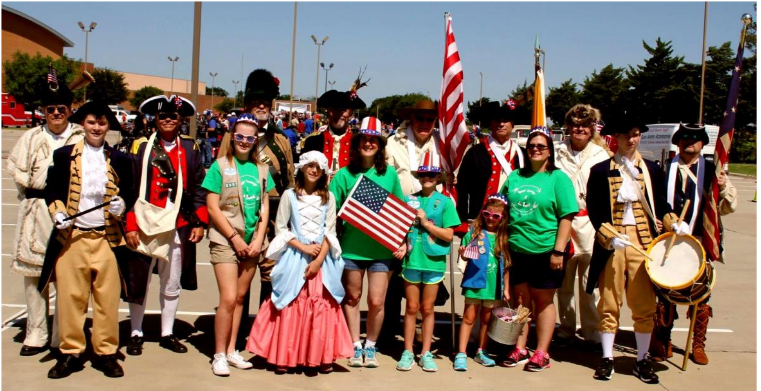
Compatriots of EFT Chapter and Girl Scout Troup 8769 prepare to walk in the Rockwall Independence Day parade (above) and during the parade (below).