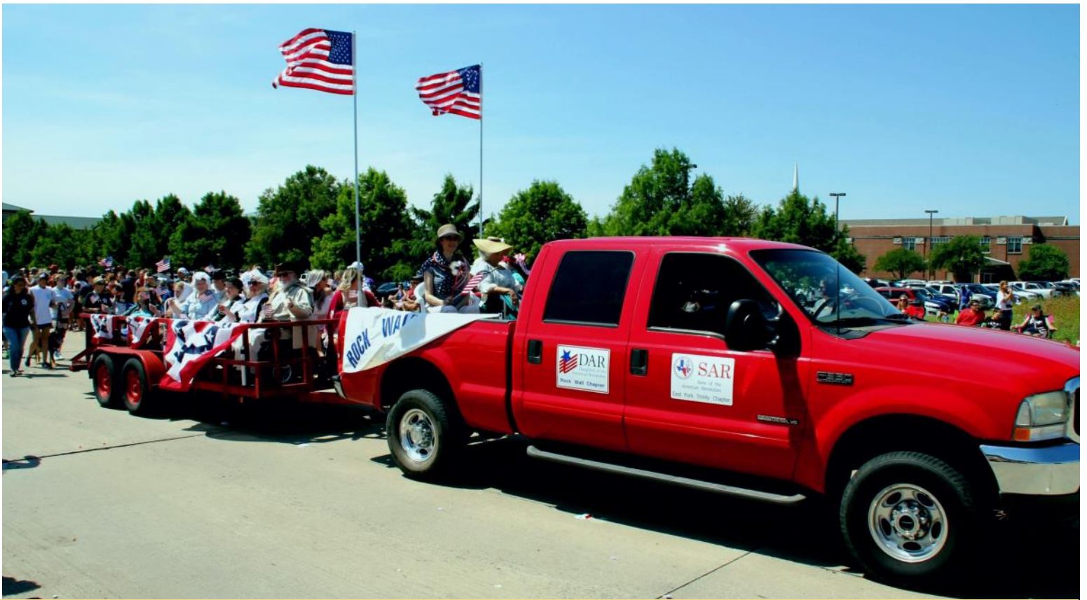
What a fine looking crew!