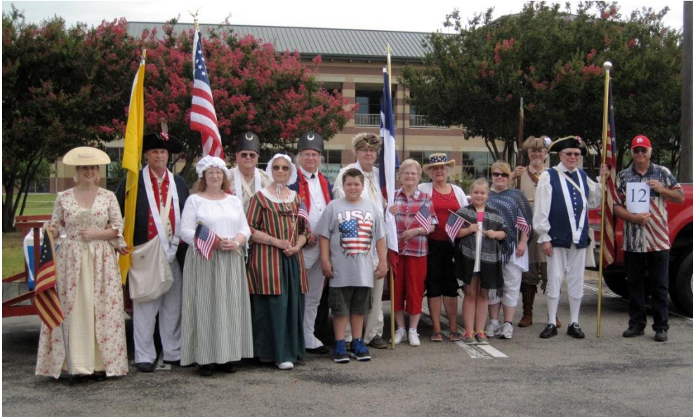
A great 4 th of July for the EFT chapter.