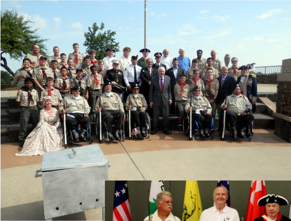
Congressman Sam Johnson's Flag Retirement Ceremony on June 18, 2016.