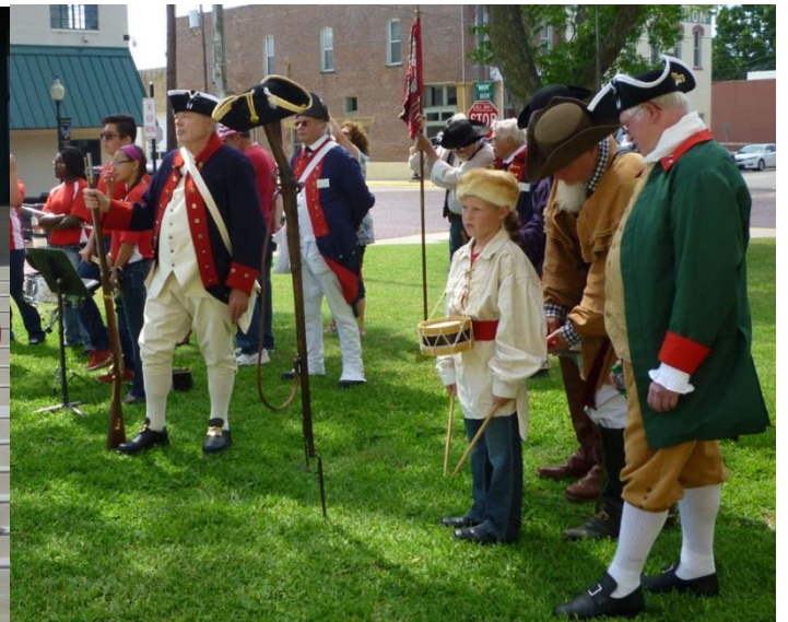
The reading of the Declaration of Independence