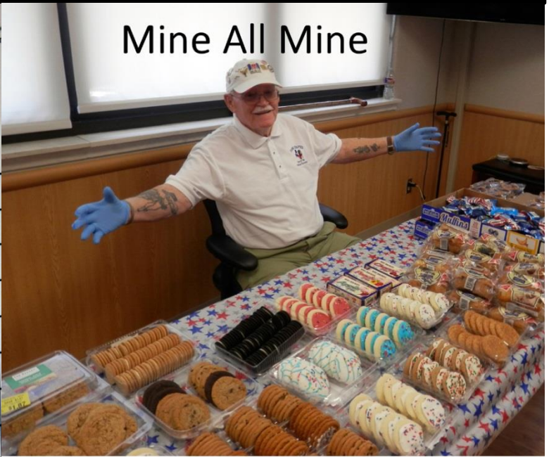
Mine All Mine