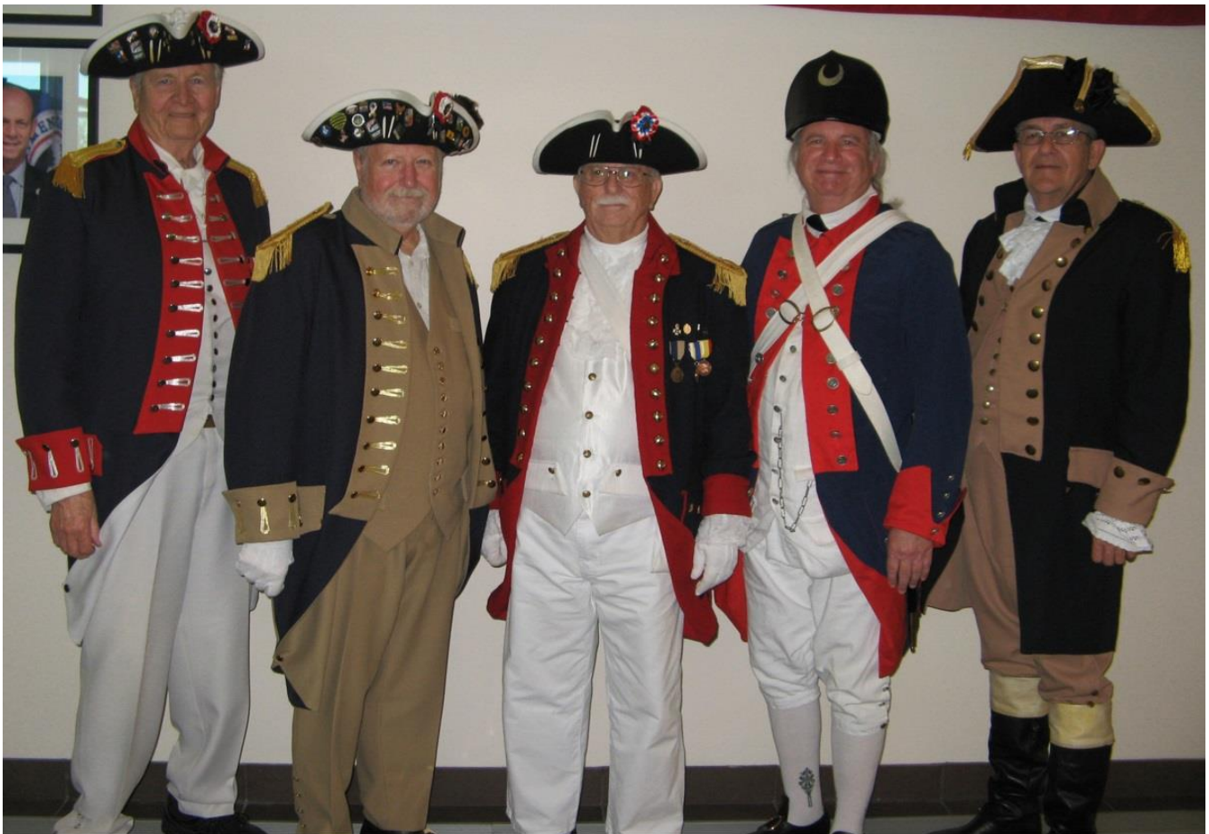
Presenting the Colors at the Naturalization Ceremony on March 14, 2016