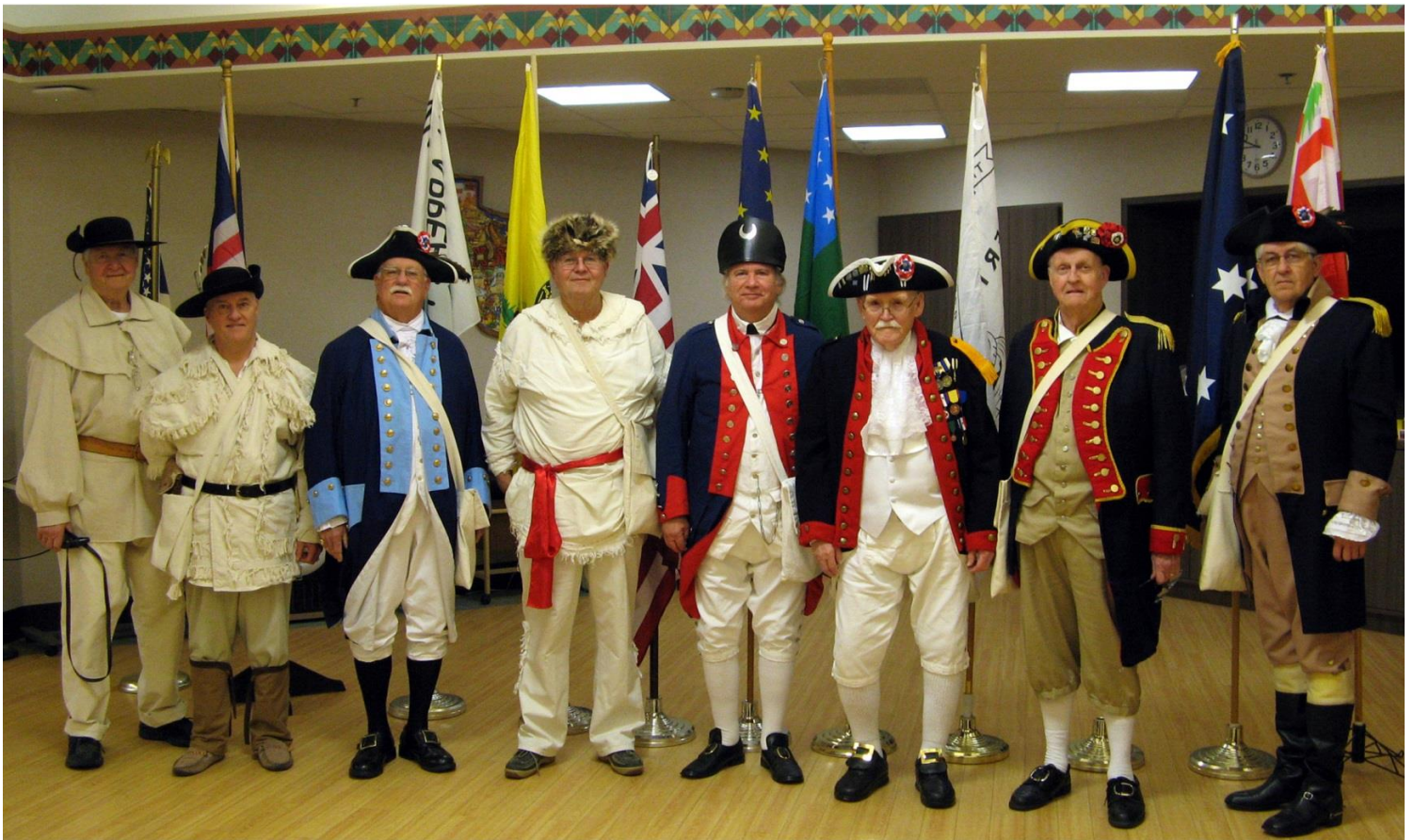
On March 10th members of the Plano, East Fork Trinity and Edmund Terrell Chapters of the SAR made a Flag Presentation to members of the Bonham VA. We had over 35 guests attend the presentation.