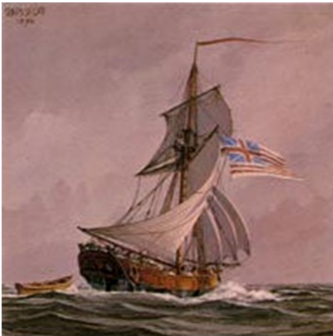
Fig. 1. Armed Sloop similar to the Commerce .