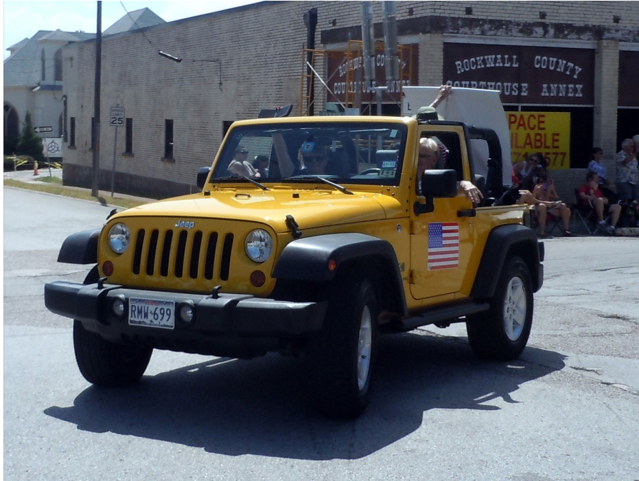
Jane, Mindy, and Vivian follow along after the Color Guard to protect them from the buzzards that were beginning to circle.