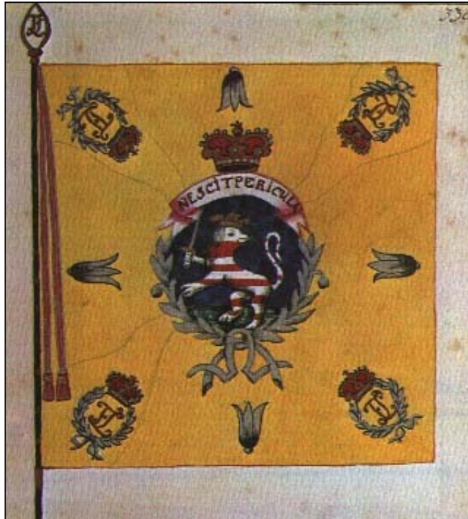
Flag of the Von Ditfurth Regiment, Hesse-Kassel

Most Americans know that King George III hired German troops, referred to as Hessians because over half of the troops were from the German principality of Hesse-Kassel, to fight against the Patriot Army in the American Revolutionary War. But it appears that few Americans know much of anything more about the Hessians as to who they were, why they were in America, where they came from, and what became of them.