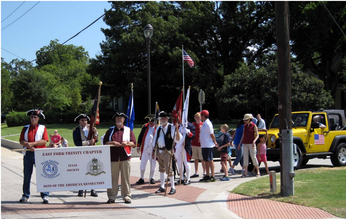
Getting ready.