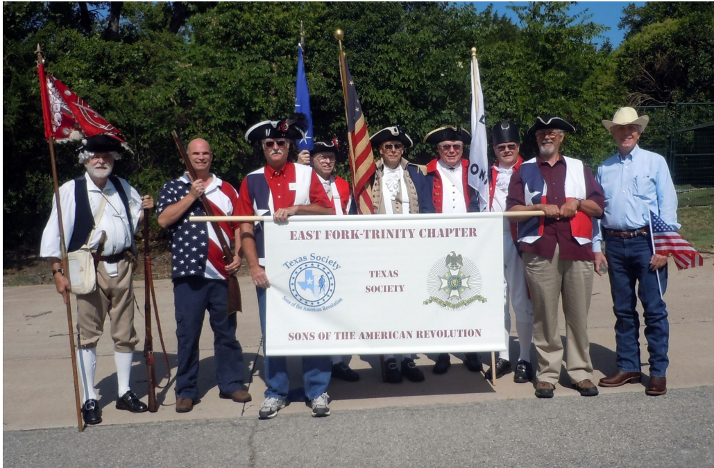
The Chapter's Color Guard with State Senator Bob Deuell