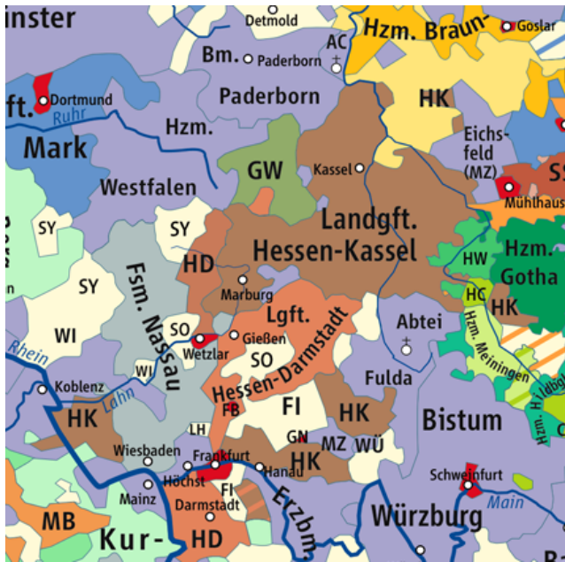
Hesse-Kassel Principality located in Germany at the head waters of the Ruhr River on the West and the Fulda Gap on the East.

There were six princes or heads-of-state of small German principalities who leased troops from their provinces and it is reported that one received as much as 160,000 English pounds for the service of his soldiers in America from 1776 to 1782. The King of Prussia had little to say over the renting out of these armies as the principalities involved were small and difficult to control. Some of the heads-of-state were known for their cruelty and lack of concern for their subjects and cared little for the lives and well-being of soldiers in their armies, while others were heavily involved in the selection of experienced officers and the training of the regiments for combat.