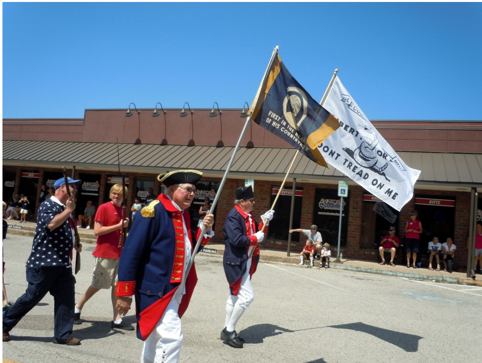
The parade nears the end.