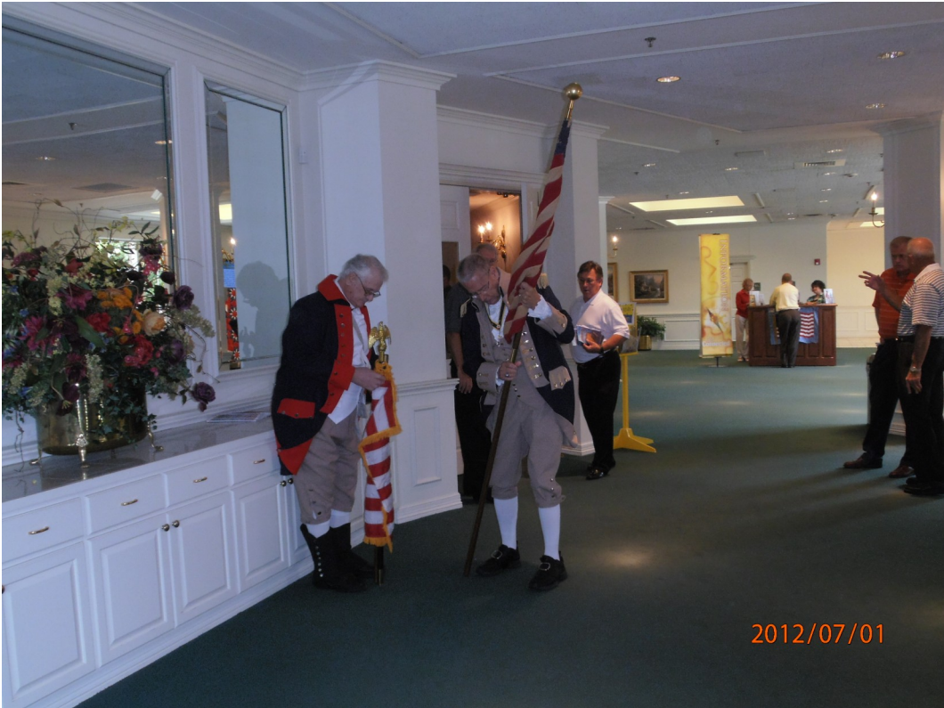
The next four pictures are from the flag presentation at the First Baptist Church in Rockwall.