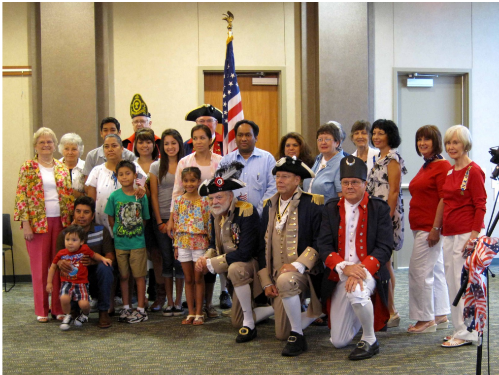
New citizens, Dar members, SAR members, and guests.