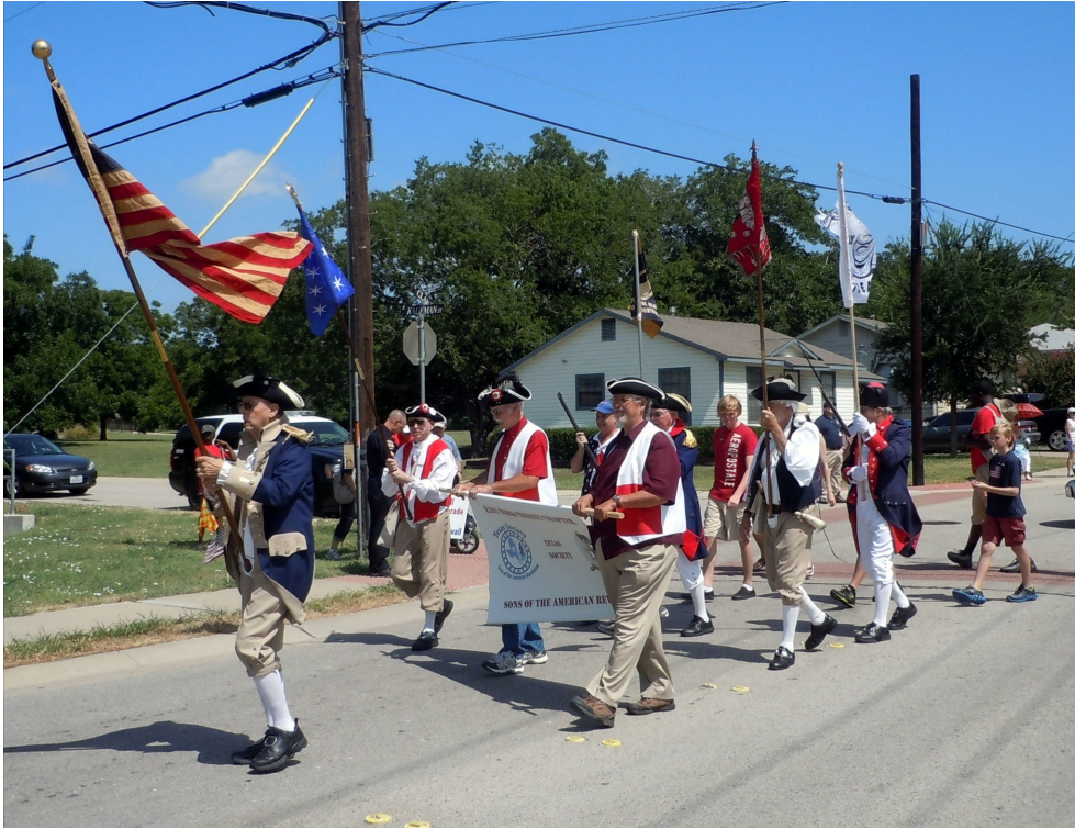
After a long wait, the parade begins.