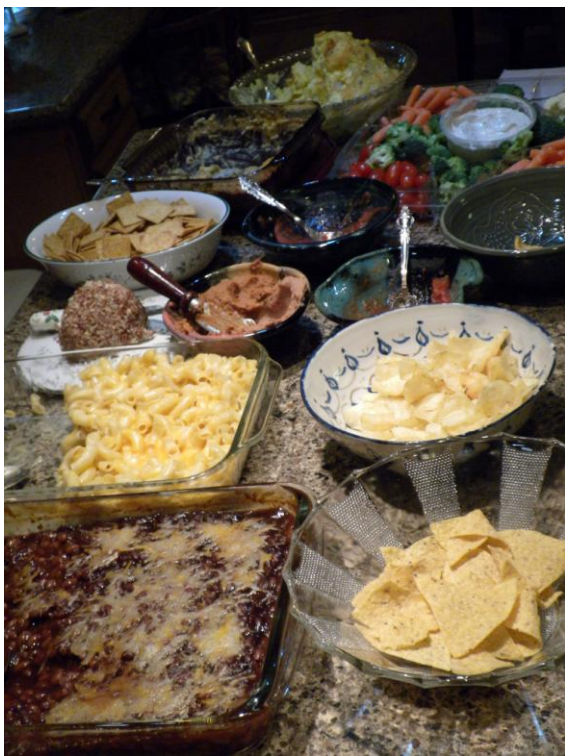
Now, that looks good