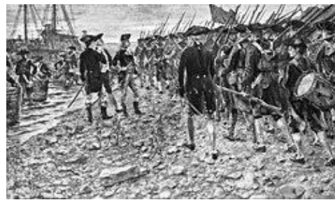
Brigadier-General Richard Montgomery 's troops prepare to embark for the invasion of Canada from Crown Point, New York