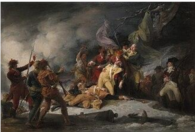
The Death of General Montgomery in the Attack on Quebec, December 31, 1775 Painting by John Trumbull , 1786

Montgomery's army had captured Montreal on November 13, and early in December they became one force that was led by Arnold, whose men had made an arduous trek through the wilderness of northern New England. Governor Carleton had escaped from Montreal to Quebec, the Americans' next objective, and last-minute reinforcements arrived to bolster the city's limited defenses before the attacking force's arrival. Concerned that expiring enlistments would reduce his force, Montgomery made the end-of-year attack in a blinding snowstorm to conceal his army's movements. The plan was for separate forces led by Montgomery and Arnold to converge in the lower city before scaling the walls protecting the upper city. Montgomery's force turned back after he was killed by cannon fire early in the battle, but Arnold's force penetrated further into the lower city. Arnold was injured early in the attack, and Morgan led the assault in his place before he became trapped in the lower city and was forced to surrender. Arnold and the Americans maintained an ineffectual blockade of the city until spring, when British reinforcements arrived.