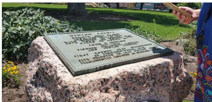
Example of a marker