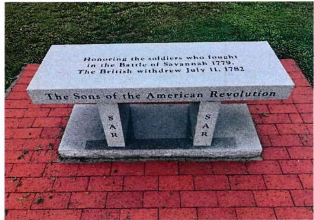
Custom Message (Site Specific)