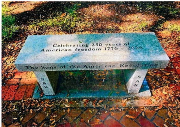
250th Message (All Sites)

One Bench in Every State By 2026 Courthouse, Square, Park, Historic Site, Cemetery