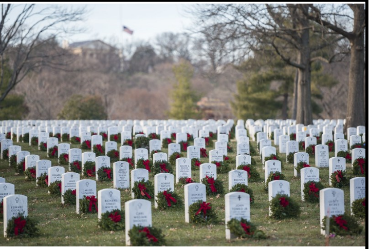
Arlington National Cemetery

The Wreaths Across American organization was established in 2007 whose goal was to place Christmas wreaths on graves in military cemeteries. In December 2008, the U.S. Senate agreed to a resolution that designated December 13, 2008 as Wreaths Across America Day. The affect around the Country has been dramatic with each passing year. The effort began earlier.