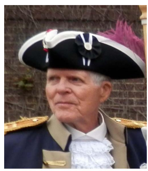
Our Commander Ready to go -

On May 28 the Ennis Polka Festival Parade was held in Historic Ennis. As you can see the towne fathers saw fit to include the Sons of the American Revolution. Chapter