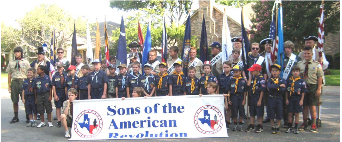
Dallas Chapter parade participants lining up before the Lake Highlands Parade. SAR in Back; Scouts and Webelos representing the 13 colonies with Sashes and Colonial Flags; Cubs in Front. The Scouts are from Troop 890 and the Pack from Pack 890.