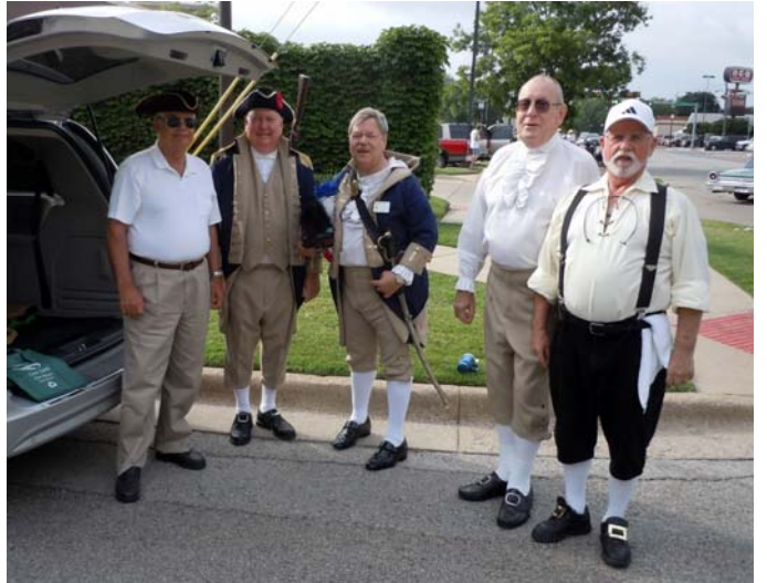
SAR members..... Preparing for the parade in Ennis