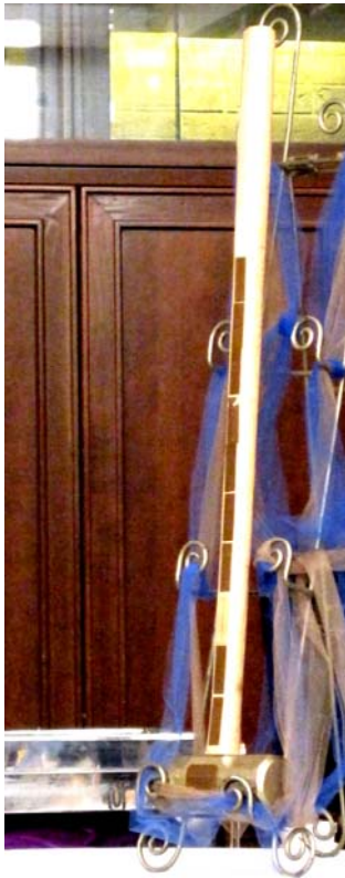
Golden Hammer Award

Checking & Cash: $ 4,280.03 Minuteman Fund: $ 8,403.22 Ritchie Fund: $ 30,444.26