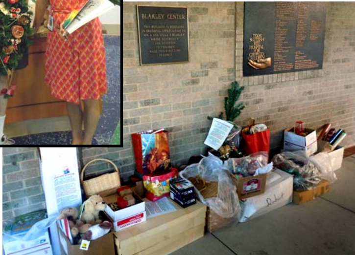
The large number of holiday items donated to Scottish Rite Hospital for Children