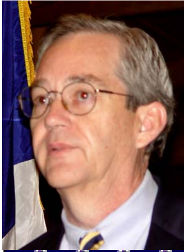
President: David Temple

The following Compatriots were installed as the new Dallas Chapter Officers on January 8: