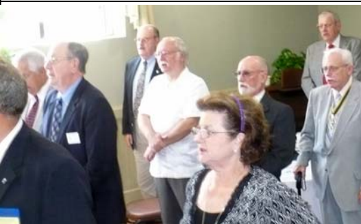
"My Country 'tis of The..."