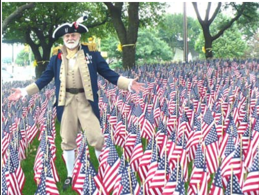
"Who spilled the bloomin' Flag Seeds?"