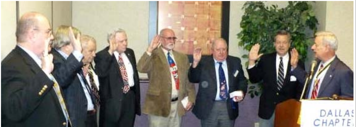
Another view of the inauguration. See Page 2 for identification of these compatriots.