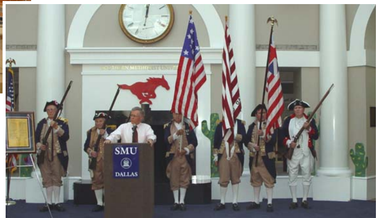
The picture and caption at right appeared in the SMU Daily Campus on September 22.