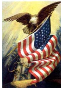
More of the display created by Tom Whitelock