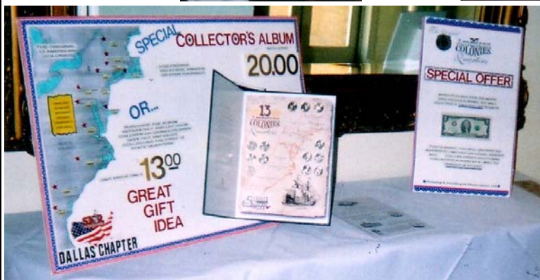
Part of the magnificent display created by TXSSAR Historian Tom Whitelock