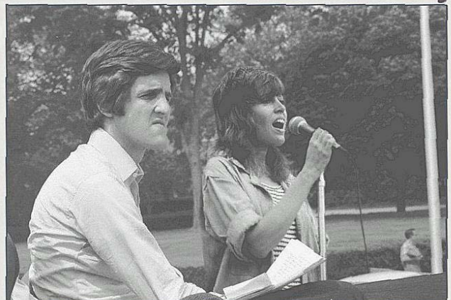
Actress And Anti-War Activist Jane Fonda Speaks to a crowd of Vietnam Veterans as Activist and former Vietnam Vet John Kerry (LEFT) listens and prepares to speak next concerning the war in Vietnam