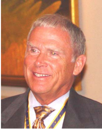
Judge John Marshall