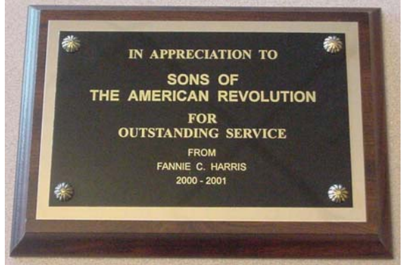
T he Dallas Chapter received a plaque from the Fannie C. Harris Elementary School for assistance in tutoring children for the TAAS Test and for other ongoing contributions of time during 2000-2001.