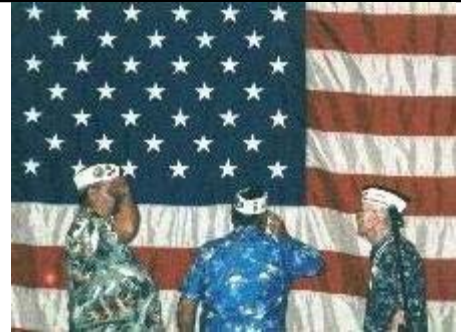
Three Pearl Harbor survivors salute their flag on Flag Day 2001