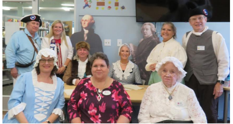
September 19, 2024 Thursday – Martha Jefferson Randolph NSDAR Constitution Week Celebration at Lakeway Church Pottsboro.