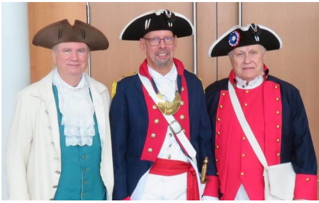
September 17, 2024 Tuesday – Naturalization Ceremony UT Dallas-Richardson 800 W Campbell Rd Richardso.