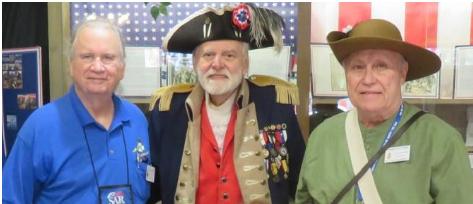
September 27, - October 20 - Participate in the Recruitment for Membership in the Sons of the American Revolution at the Jane Douglas House Daughters of the American Revolution at the State Fair of Texas.