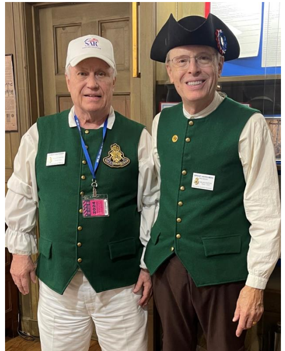
September 29, 2024 - Sunday – Vietnam Veterans memorial service presented by the David Pendleton Society of the Children of the American Revolution at the State Fair.