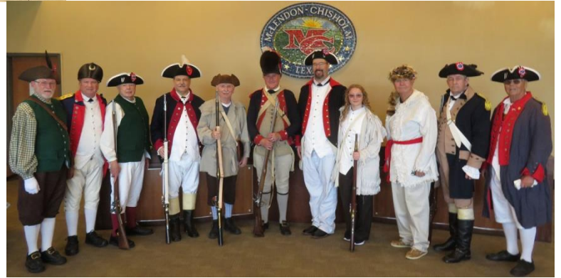
Memorial Day in McClendon-Chisholm