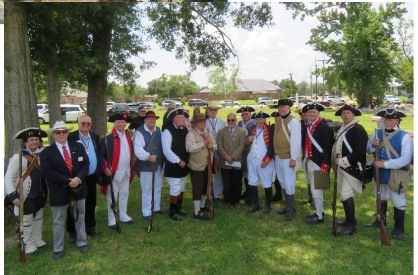
Grave Marking Ceremony in Lake Charles, LA