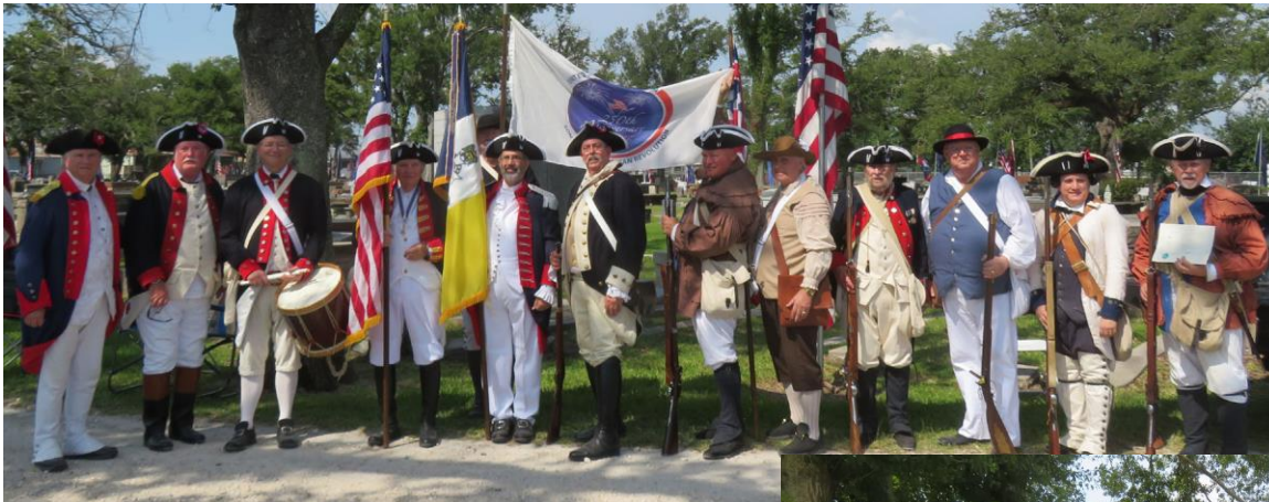
Avenue of Flags in Lake Charles, LA